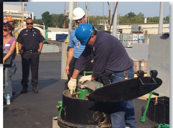
Phosgene Drill 2018 Incident Command (Submitted photo)