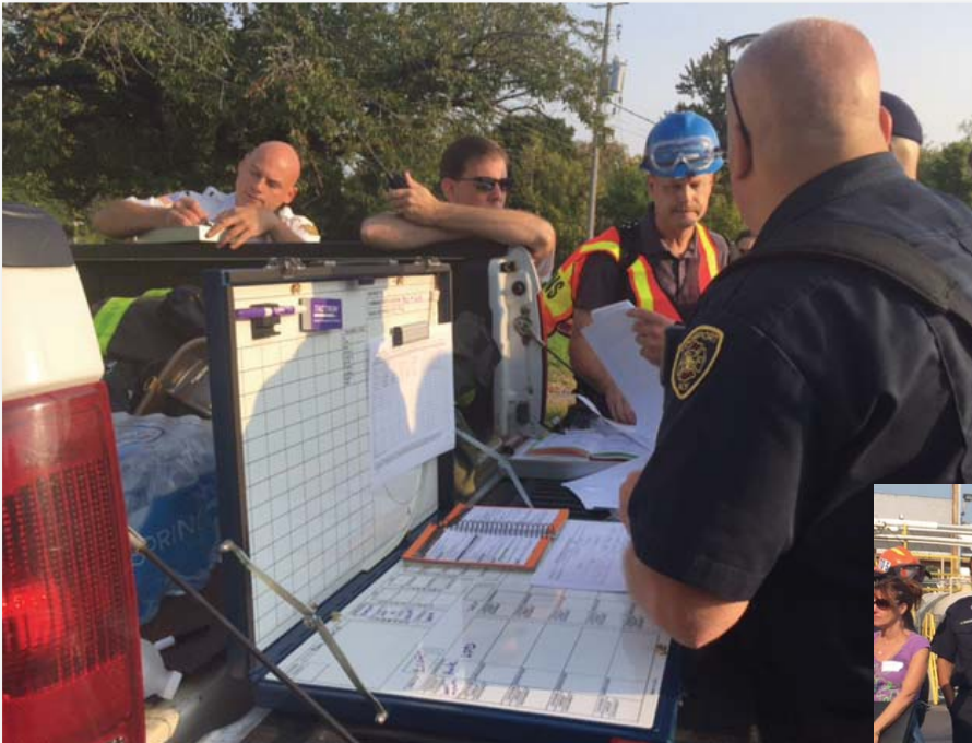
Phosgene Drill 2018 Hands On Training

The day provided significant insight in how to mitigate an incident and valuable contacts should they be needed.