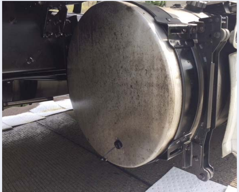
Hole in saddle tank.