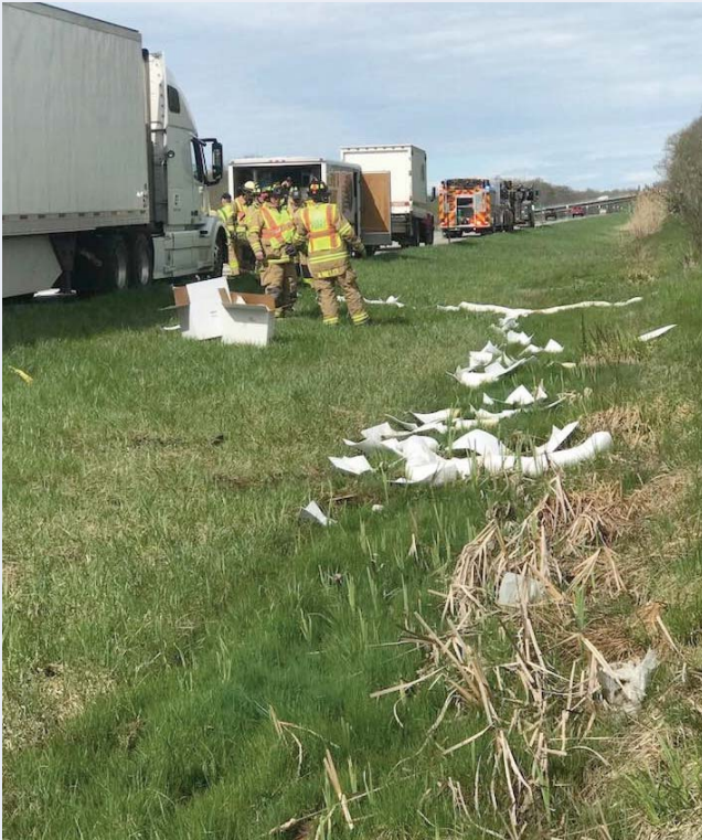
Responders work to capture product.

A tractor trailer hit debris on the highway and punctured a saddle tank spilling approximately 50 gallons of diesel fuel. The team was able to plug the leak and prevent further fuel loss. Bemus Point Fire and NYS DEC assisted at the scene.